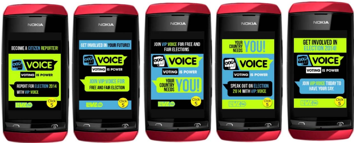
Table 5 : Example splash screens for recruitment into platform