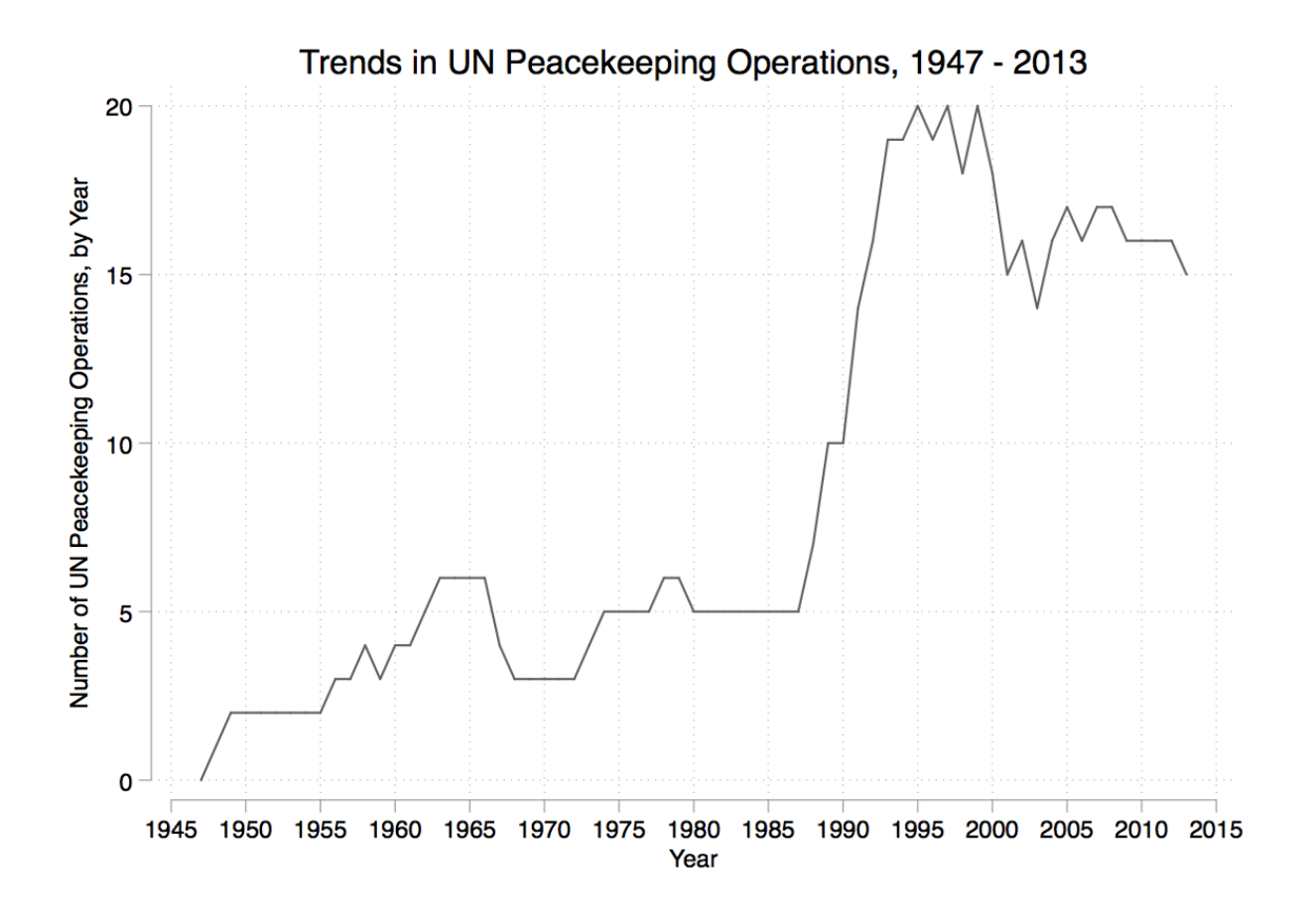
Figure 2 reveals the large increase in the number of U.N. peacekeeping operations between 1989 and 2000, a period that coincided almost exactly with the drop in the number of civil wars during that time. Together, the removal of external financing for civil wars and the rise in the availability of peacekeepers meant that a negotiated settlement became a more attractive option for many combatants than continued fighting. The result was fewer civil wars.