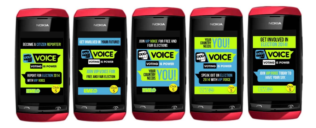
Table 5: Example splash screens for recruitment into platform